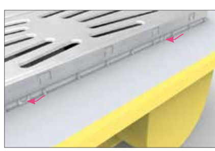
Secondary drainage to be opened if required