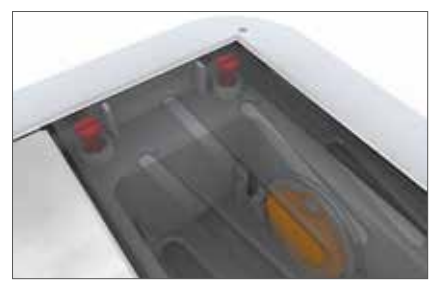
Height-adjustable cover/ non-return valve of side inlet

visible dimensions of all models 25 \times 25 \text{ cm}