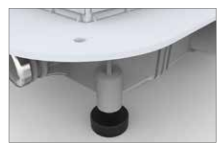
Rubber feet for noise reduction