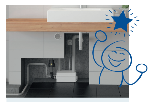
With dimensions of only 135 x 320 x 176 (H x W x D) mm he also fits comfortably into a pre-wall installation.